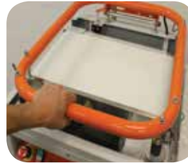
Ergonomic by design, the tubular seal arm delivers dependable, long-term service.